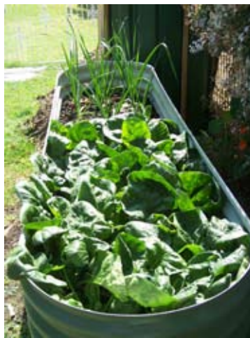
Spinach and leeks