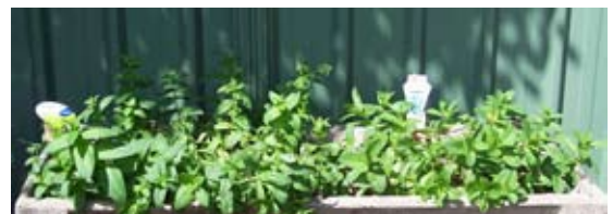
Two types of mint